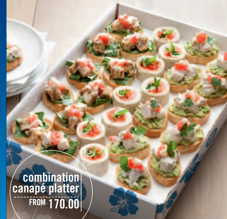
combination canapé platter FROM 170.00