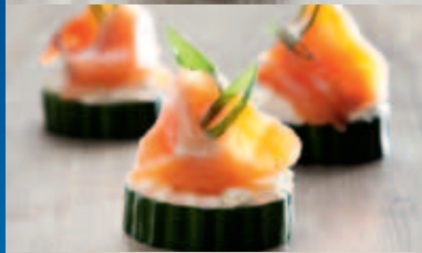
salmon cucumber bites