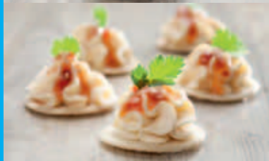
thai chilli bites