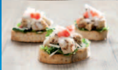
chicken caesar canapés