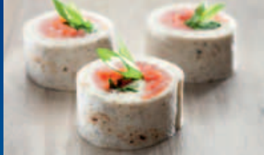
smoked salmon canapés