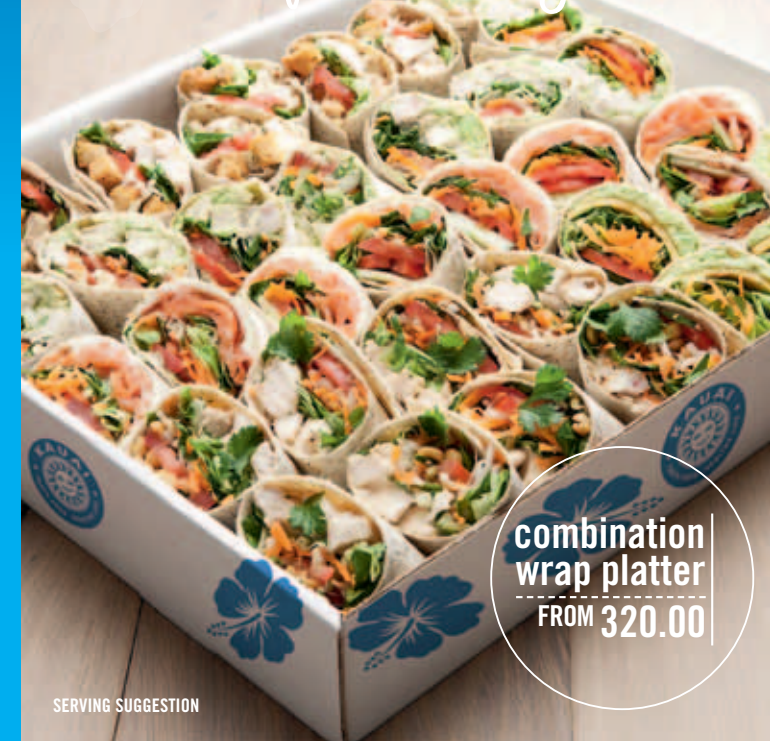
combination wrap platter FROM 320.00