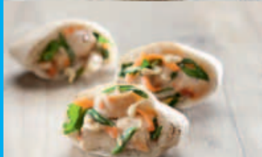
mini thai chicken pockets