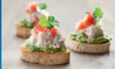
princess royale canapés